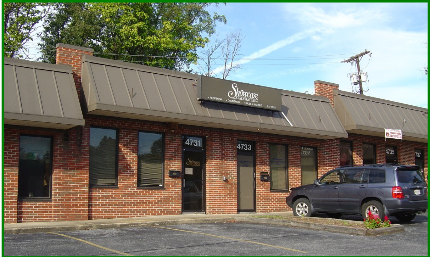
4731 Sellman Road, Beltsville, MD 20705